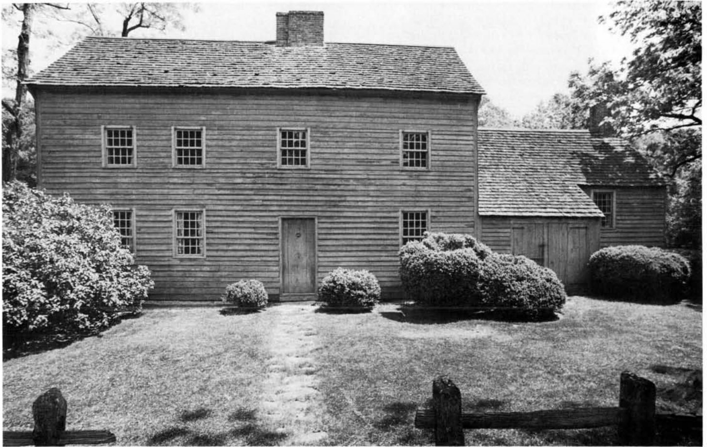
Thompson House, Setauket, Suffolk County, New York. Built c. 1709, the Thompson House is a distinguished example of early 18th century domestic architecture found on Long Island, and recalls the area's early agrarian settlement. This vernacular building was influenced by New England's Cape Cod and saltbox forms.

A n important mechanism to identify, evaluate, register, and protect historic resources is the Historic Preservation Fund (HPF) grant program. Money is appropriated from the HPF by the U.S. Congress for matching grants to the States for preservation programs that will identify, evaluate, register, preserve, and protect historic properties. Major operational authority has been delegated by the National Park Service (NPS) to the States, including the selection of projects to fund.