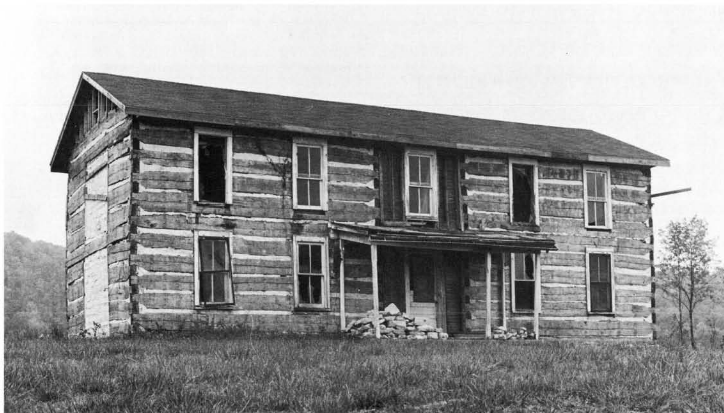
The Andrew Trumbo Log House, Frankfort, Franklin County, Kentucky. This two story dogtrot type log house, constructed c. 1810, is an example of an important vernacular type of early residential construction in Kentucky.