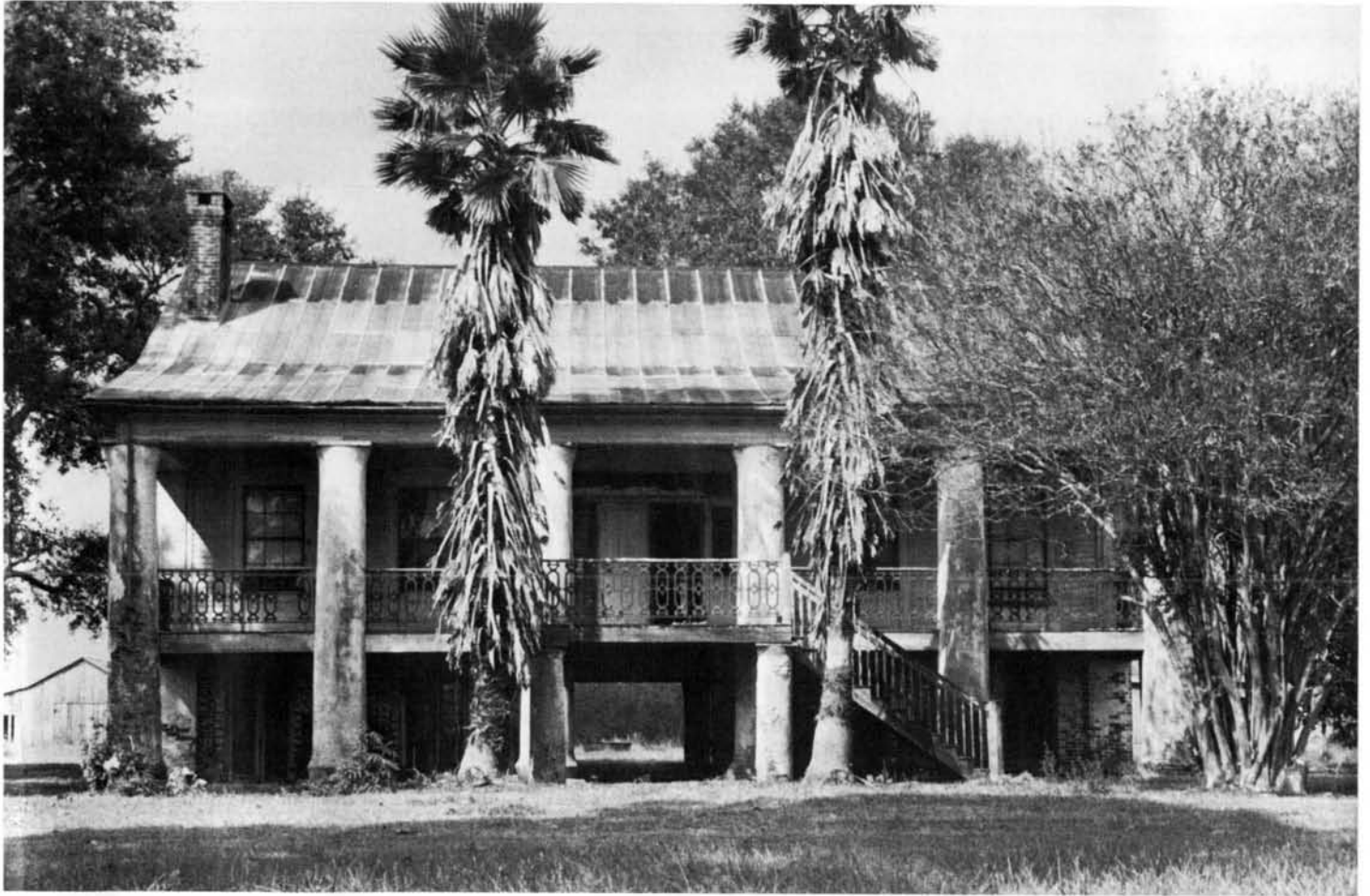
Macland Plantation House, Washington vicinity, St. Landry Parish, Louisiana, illustrates the importance of a transition in architectural styles. Constructed c. 1850, it is a fully developed Greek Revival style two story plantation house and a landmark in the gradual integration of Anglo-American features into the indigenous Creole raised plantation house form of the French-settled south Louisiana.