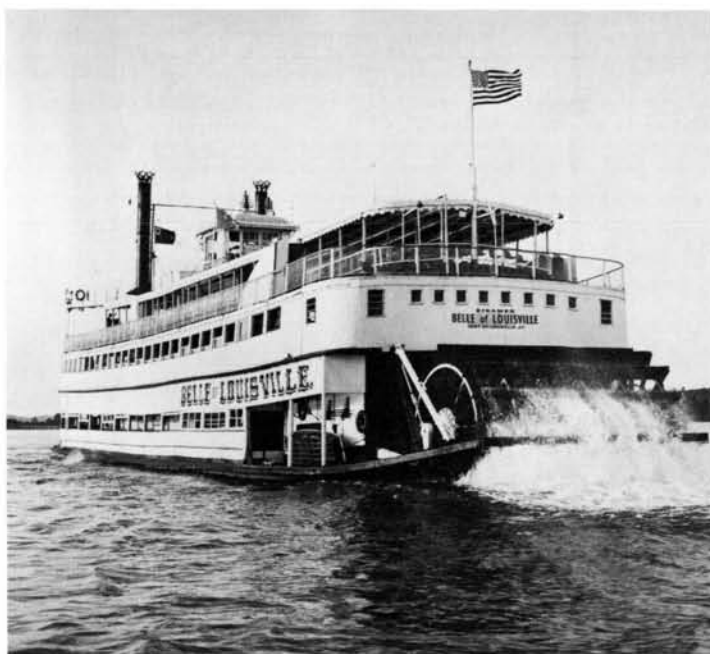
Belle of Louisville, Jefferson County, Kentucky. Examples of ship construction can qualify for historic or engineering significance. Constructed in 1914, the Belle of Louisville is one of only two sternwheel river passenger boats still operating under steam, and is the sole remaining Western Rivers day packet boat.

Since 1976, the U.S. Internal Revenue Code has contained incentives for historic preservation. These incentives encourage investment in income-producing historic buildings, the revitalization of historic neighborhoods, and the donation of preservation easements. Current incentives (established or retained by the Tax Reform Act of 1986) include a 20% tax credit for the substantial rehabilitation of historic buildings for commercial, industrial or rental residential purposes, and a 10% tax credit for the substantial rehabilitation for nonresidential purposes of buildings built before 1936. However, for buildings individually listed in the National Register or for contributing buildings in registered historic districts, only the 20% tax credit is available. In addition, the law retains the provisions established by the Tax Treatment Extension Act of 1980 that permit income and estate tax deductions for charitable contributions of partial interests in historic property (i.e., easements).