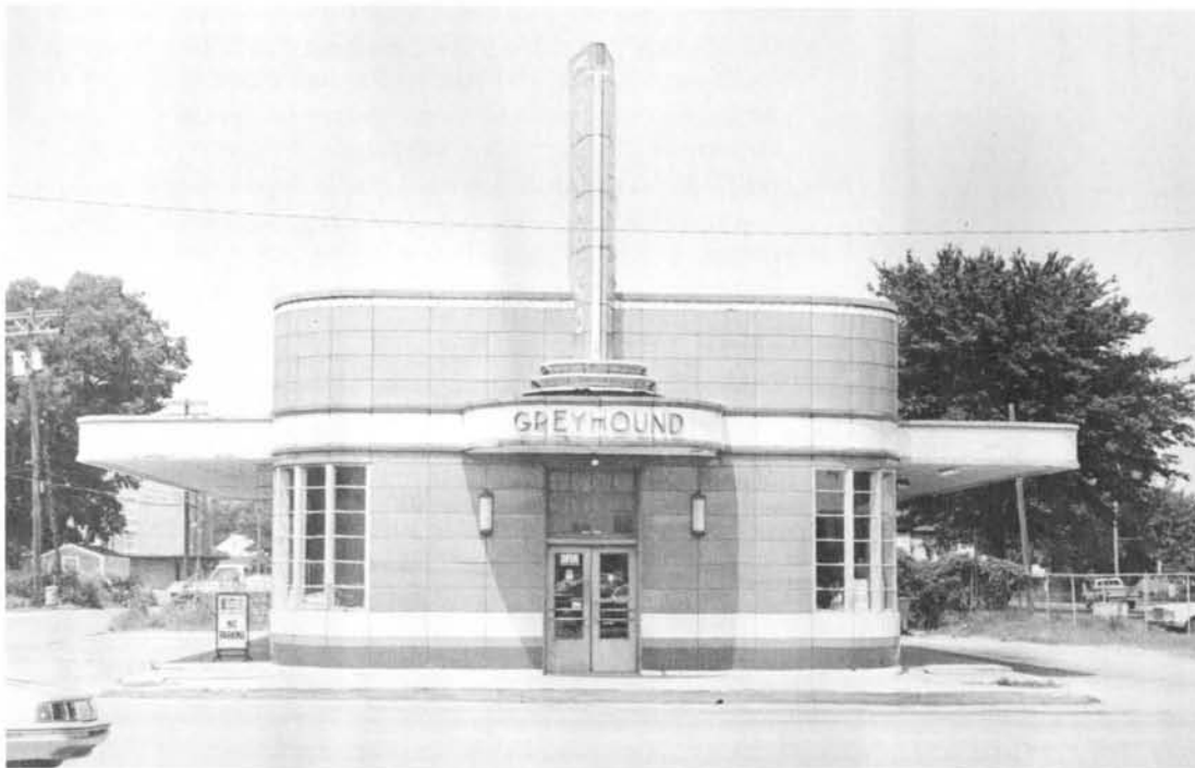
Blytheville Greyhound Bus Station, Blytheville, Arkansas County, Mississippi. Constructed in 1937, this bus station is one of the purest examples of the Art Moderne Style in the State's commercial architecture. The building is virtually unaltered on the exterior and retains a high degree of original interior features.

This act authorizes the General Services Administration to convey approved surplus Federal property to any State agency or municipality free of charge, provided that the property is used as a historic monument for the benefit of the public. To qualify for this provision, the structure must be included in or eligible for inclusion in the National Register. Such free use is also applicable to revenue-producing properties if the income in excess of rehabilitation or maintenance costs is used for public historic preservation, park, or recreation purposes, and if the proposed income-producing use of the structure is compatible with historic monument purposes as approved by the Secretary of the Interior. It includes recapture provisions under which the property would revert to the Federal Government should it be used for purposes incompatible with the objective of preserving historic monuments.