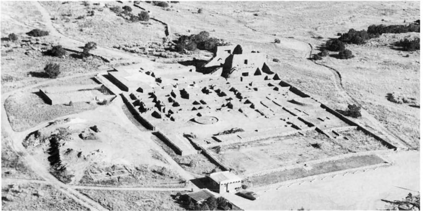
Pecos National Monument, Pecos vicinity, San Miguel County, New Mexico. Archeological sites can provide information on the lifestyles and building techniques of past periods. These large mounds, restored kivas, and stone and adobe ruins mark the location of two Pecos Indian Pueblos and a 17th century Spanish mission. The site declined in the 18th century from disease and hostile Indian action, and was abandoned in 1838. (Photo by: unknown).

Public participation and awareness in historic preservation help form a statewide constituency that strengthens the effectiveness and visibility of the State program. States are responsible for implementing a public participation process which ensures an opportunity for citizen input in the formulation of the HPF annual grant application, thus ensuring public scrutiny, review, and participation in the establishment of the State's annual goals and priorities.