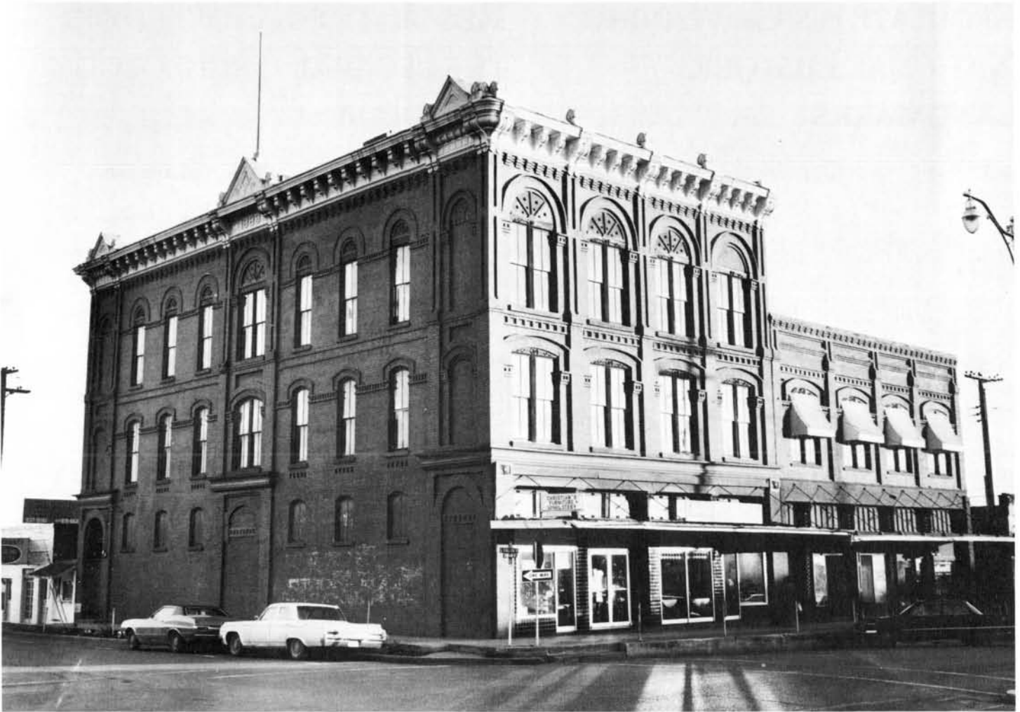
Ellis County Courthouse Historic District, Waxahachie, Ellis County, Texas. Many small communities retain their late 19th and early 20th century commercial districts intact. This district of approximately 50 commercial buildings reflects the town's importance as the center of a cotton producing region. Pictured is the 1889 Italianate style Masonic Building.