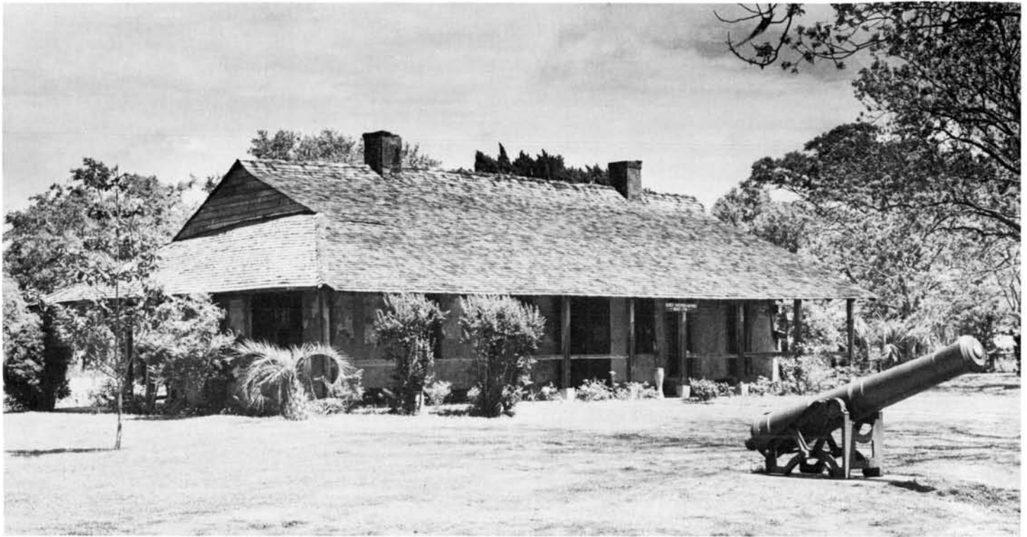
Old Spanish Fort (Old French Fort), Pascagoula, Jackson County, Mississippi. Built c. 1721, this building is frame construction with plastered oyster shell concrete fill. Originally part of an early French land grant, this building is believed to have been part of a palisaded complex built for the defense of early settlers.