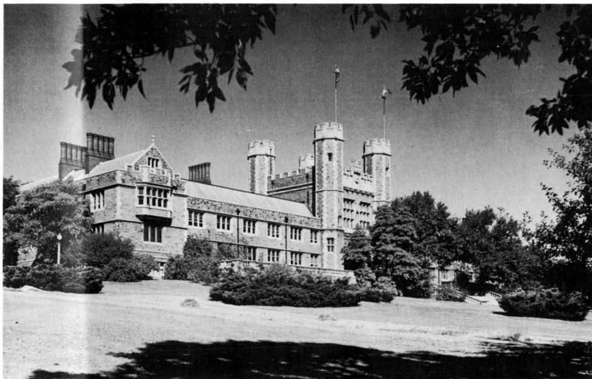
Brookings Hall (Washington University Hilltop Campus Historic District), St. Louis, Missouri. Constructed in 1900, Brookings Hall, with its tower with turrets and large grids of stone-mullioned windows, is a good example of the Collegiate Gothic style of architecture, a style popular at many universities in the early 20th century.