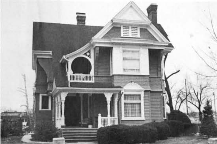
730 St. Louis Street