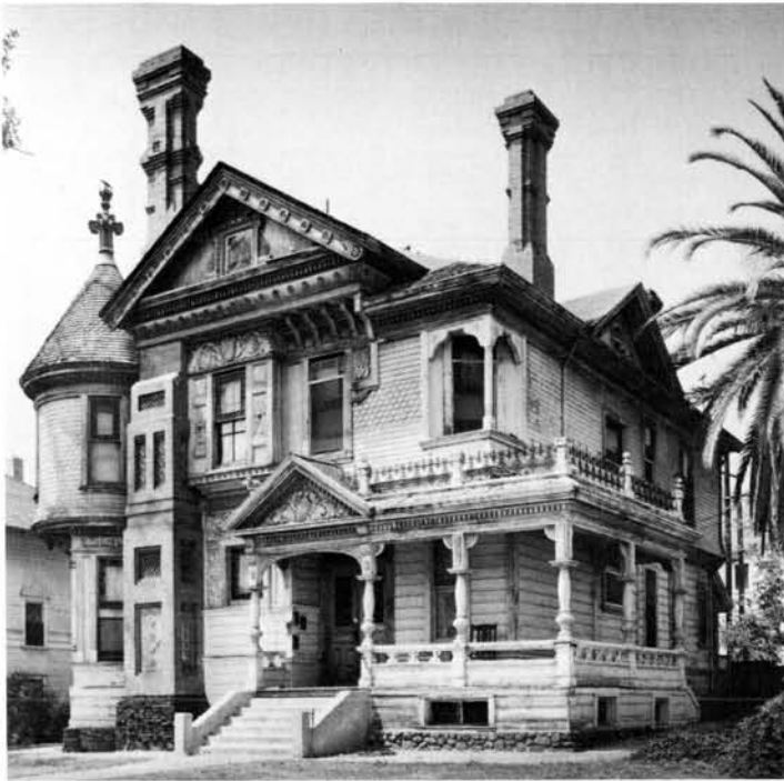
Hale House, Los Angeles, Los Angeles County, California. This Queen Anne style house, built c. 1885, with its exuberant woodwork on the porch, cornice, gables, and second floor oriel, exhibits a busy, eclectic design of great variety and vitality.