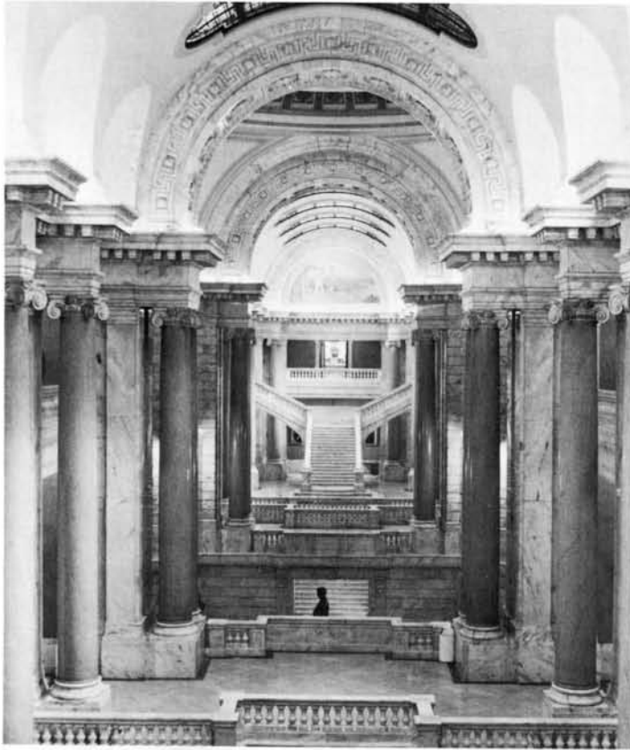
Kentucky State Capitol, interior view, Frankfort, Franklin County, Kentucky. The importance of the early 20th century State capitol building in the civic life of Kentucky is reflected in its magnificent interior.

T he National Park Service's Cultural Resources Programs provide a variety of historic preservation services. These programs are conducted under the administration of the Associate Director for Cultural Resources. The programs and their responsibilities are described below. Many operations are performed by regional offices. Further information about a program can be obtained by writing to the appropriate division at the National Park Service, U.S. Department of the Interior, P.O. Box 37127, Washington, D.C. 20013-7127.