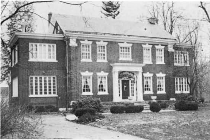
814 St. Louis Street