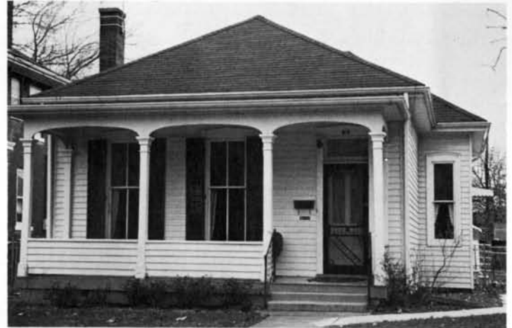
817 St. Louis Street