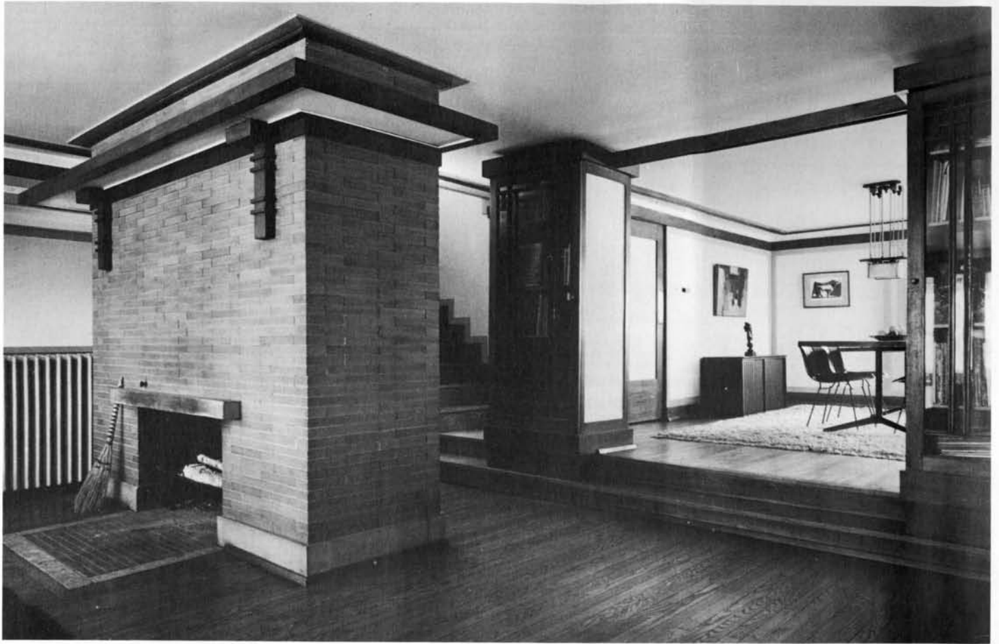
Mrs. Thomas H. Gale House, Oak Park, Cook County, Illinois. Buildings can derive significance from distinguished interiors. This building, constructed in 1909 by the architect Frank Lloyd Wright, is one of Wright's most successful small house designs of his early Prairie Style houses.