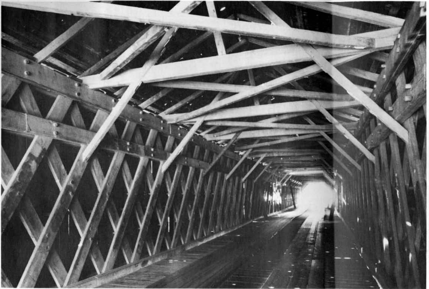
Watson Mill Covered Bridge, Comer vicinity, Oglethorpe County, Georgia. This 1885 frame bridge, an important example of the patented Town lattice truss design, has a 229 foot span over the South Fork of the Broad River, and is still in use.