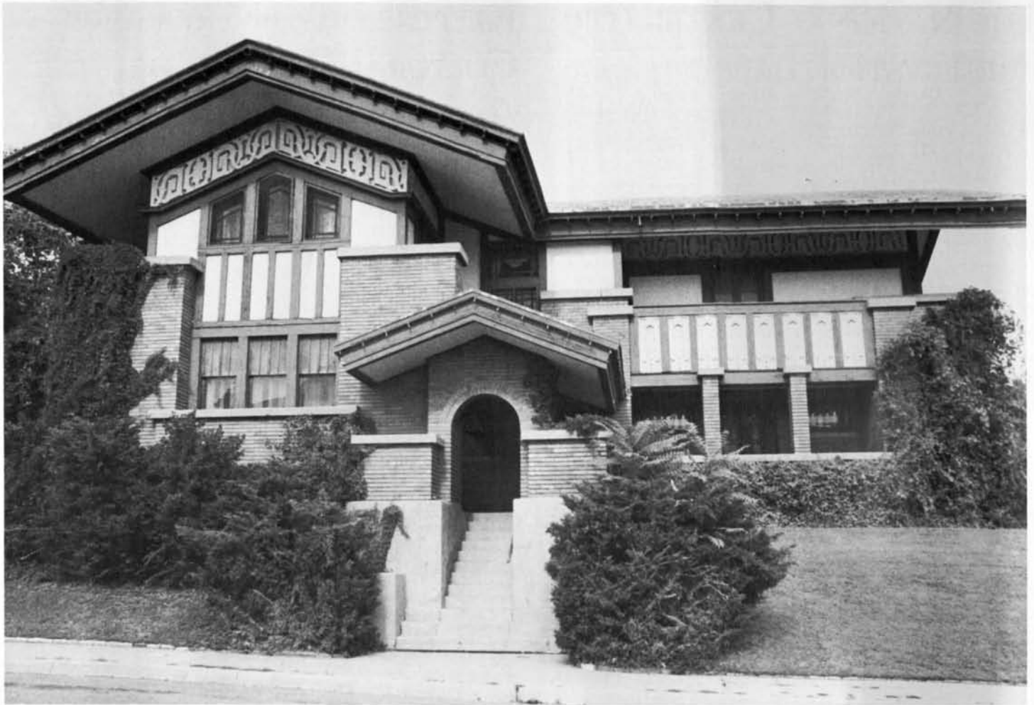
Henry C. Trost House, El Paso, El Paso County, Texas. Constructed in 1908, this is the most outstanding example of architect Henry C. Trost's Prairie Style buildings. Trost was the foremost architect of the style in the Southwestern U.S. The building is distinguished by its Sullivanesque ornament and its low roof with massive projecting eaves.